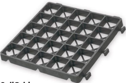
SoilGrid In-ground applications