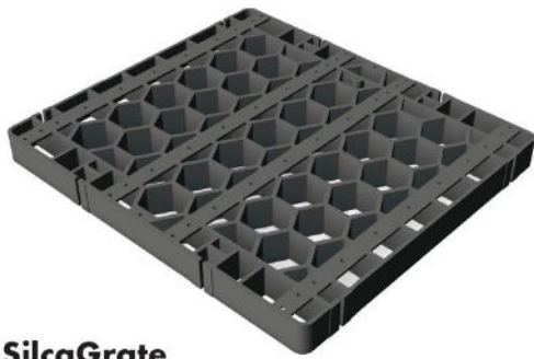
SilcaGrate Above ground applications